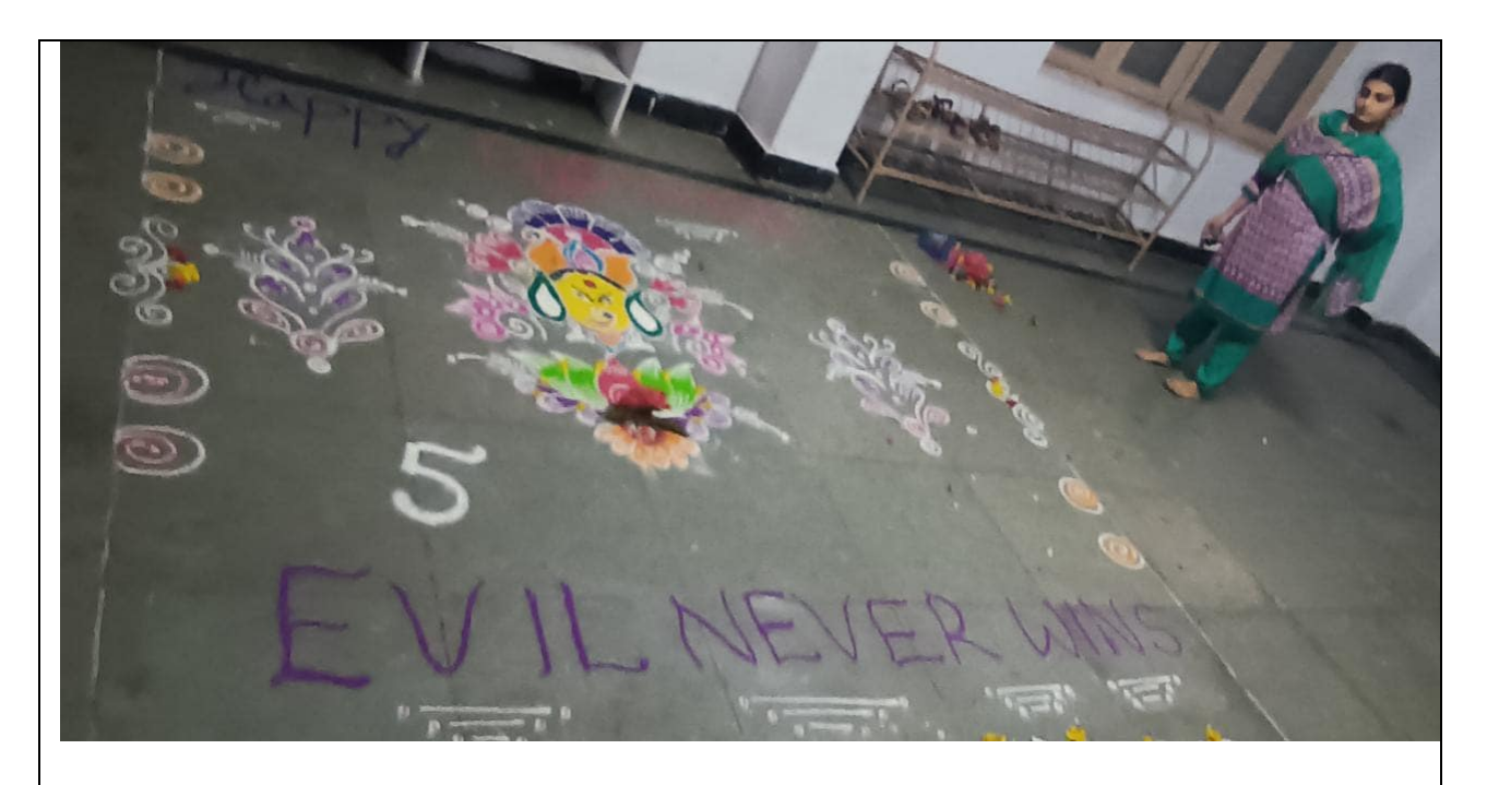
Rangoli of dussehra celebrations program in TEC by NSS volunteers