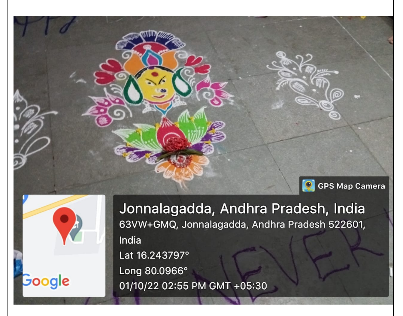
Rangoli of dussehra celebrations program in TEC by NSS volunteers