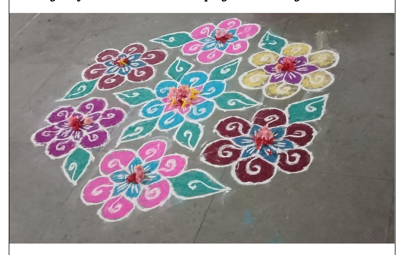
Rangoli of dussehra celebrations program in TEC by NSS volunteers